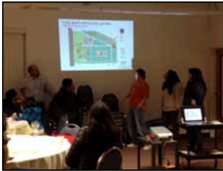
Let Us Build Cully Park!